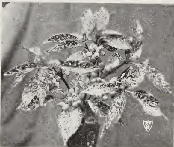
GOLD DUST LAUREL

RHODODENDRONS —Growing and grafting this lovely shrub is our specialty and we have a very fine stock of them in various sizes and colors in named varieties. Prices range from $2.50 to $5.00. Flowering size seedling varieties $1.50 to $2.50. Will furnish additional detail on request.